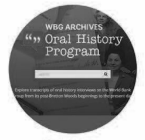
Oral History oralhistory.worldbank.org