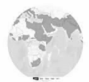
Country Historical Profiles countryhistorical profiles.worldbank.org