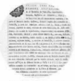
Archival Records archivesholdings.worldbank.org