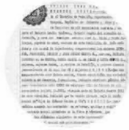
Archival Records archivesholdings.worldbank.org