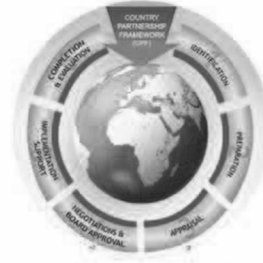
Projects & Operations worldbank.org/projects