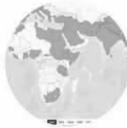
Country Historical Profiles countryhistoricalprofiles.worldbank.org