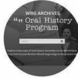
Oral History oralhistory.worldbank.org