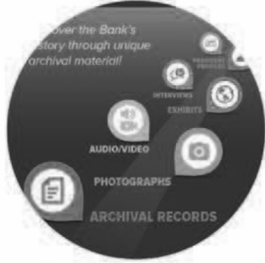
Historical Timeline timeline.worldbank.org